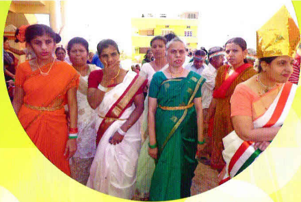
Celebration by Residents

KPAMRC welcomed the idea with an open heart and developed a project profile – Vishwashanti Niketan, Group Home Rehabilitation Complex to accommodate 70 persons with intellectual and developmental disabilities on long term basis. The estimated cost of the project was Rs. 2 crore.