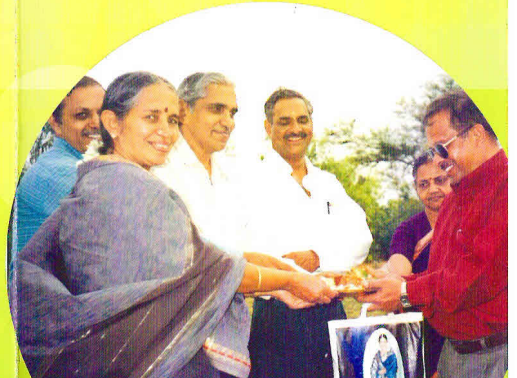
Foundation Laying Ceremony