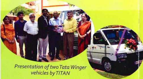
Presentation of two Tata Winger vehicles by TITAN